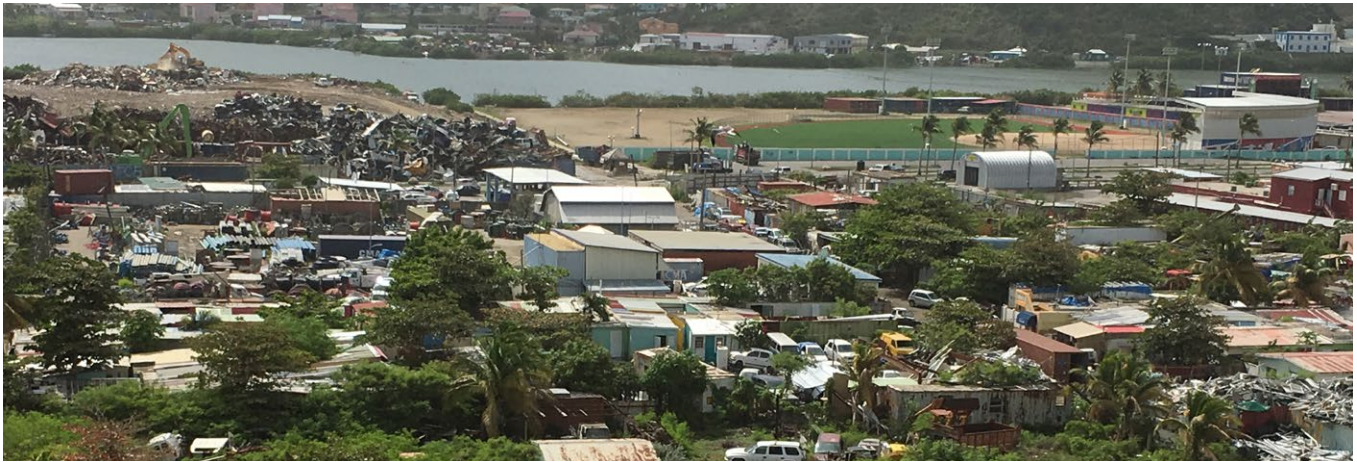
Sint Maarten Island.

often need to build additional shelters or quarantine facilities to increase distance between people. This implies additional construction waste but also greater tension with host communities, themselves under stress due to restrictions and impacts associated with COVID-19. Such tensions are important, since they can result not only in small-scale targeted violence and xenophobia but might also erupt into public protests which could facilitate disease propagation. Environmental approaches can be used to offset some of the impacts of this additional construction and to reduce community tensions, such as rehabilitation of parks and green spaces, reforestation of public spaces and streets, installation of more public waste bins or similar. COVID-19 is also likely to lead to a loss of income for the informal recycling sector, which is made up of the poorest members of society, including people on the move in many LAC countries. 2 UNEP may be able to advise on how to provide appropriate measures to maintain the recycling sector and limit the risk of recycling being discontinued due to movement restrictions or because of a rush towards alternative humanitarian response approaches (e.g. an expansion of unconditional multipurpose cash assistance to the detriment of supported livelihoods activities with environmental benefits such as recycling). UNEP can also advise on emergency livelihoods and environment during country-level socioeconomic assessments.