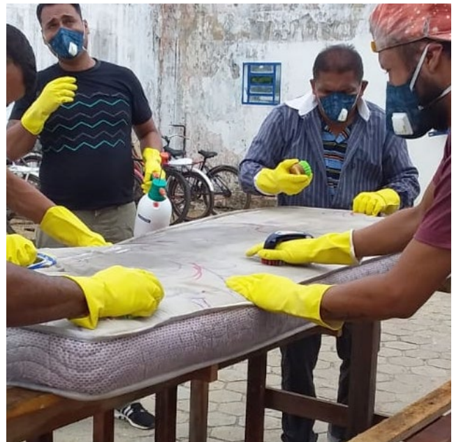
Mattresses being sanitised and cleaned to be reused avoiding the generation of massive volumes of waste. Boa Vista, Brazil.

However, other waste streams are likely to be generated by the response phase, from bottled water and alcohol gel, distributions of packaged hygiene items and masks, take-away food (instead