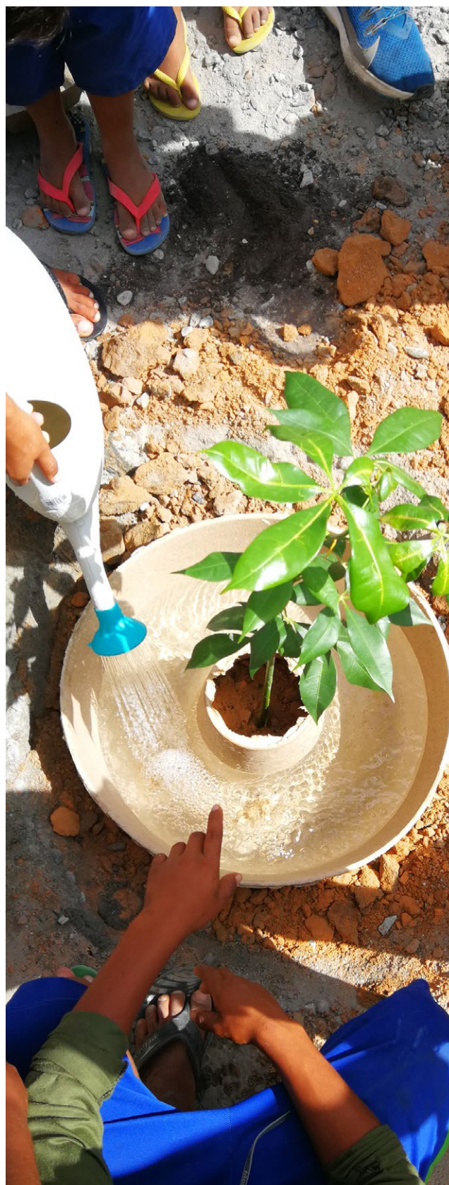
A pilot project to introduce vegetation (mostly trees) at shelters, testing a cocoon technology, including agricultural training and environmental education sessions. A committee by beneficiaries was formed. Brazil, Tarau Parú indigenous community.

One of the key issues driving the demand for COVID-19-specific response measures in existing humanitarian contexts is the need for space. Humanitarian actors