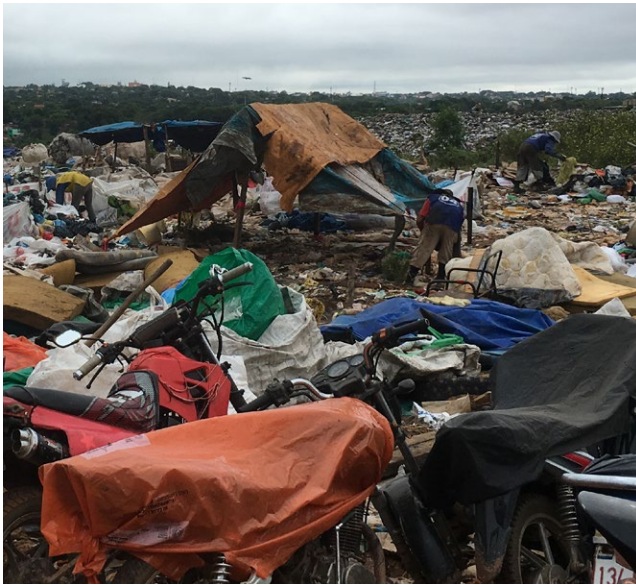
Informal recyclers separate waste on the dump every day, now increasingly exposed to the risks of unsterilised healthcare waste. Cateura, Paraguay.